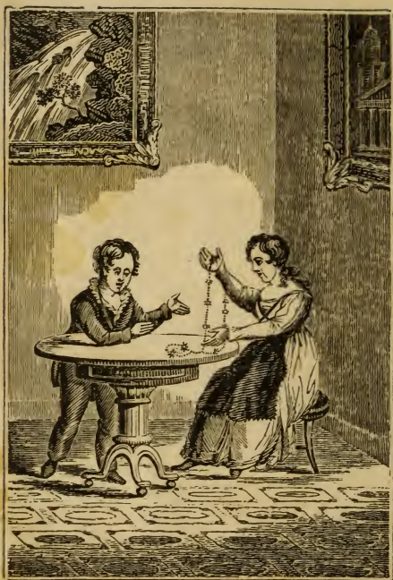
“ Once she gave her a beautiful watch-chain.”—p. 10.